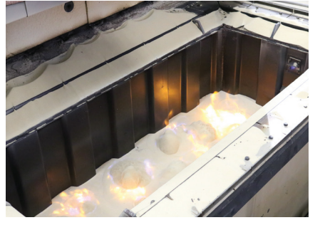
Cleaning of the manifold and melt channels using our fluidized bed ovens.