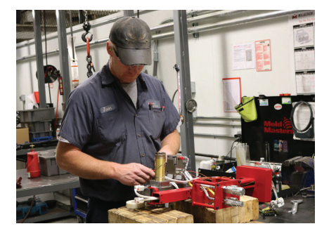
Clean water channels of mineral build-up.