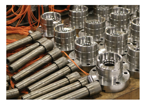
Replacement of all worn components.