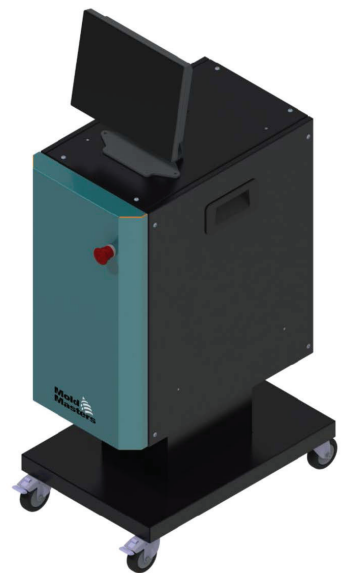
Controller shown with optional 12" touch screen and mobile stand