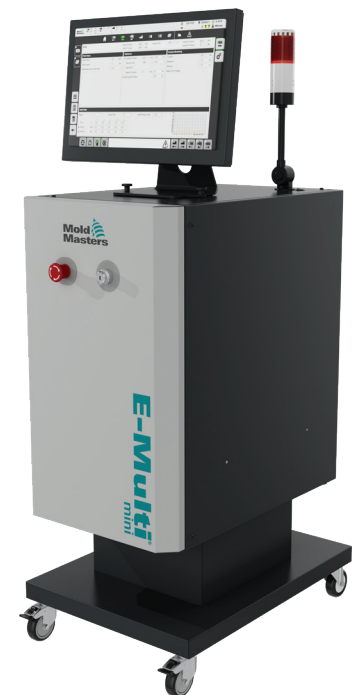
Controller shown with standard 15" touch screen and optional mobile stand.